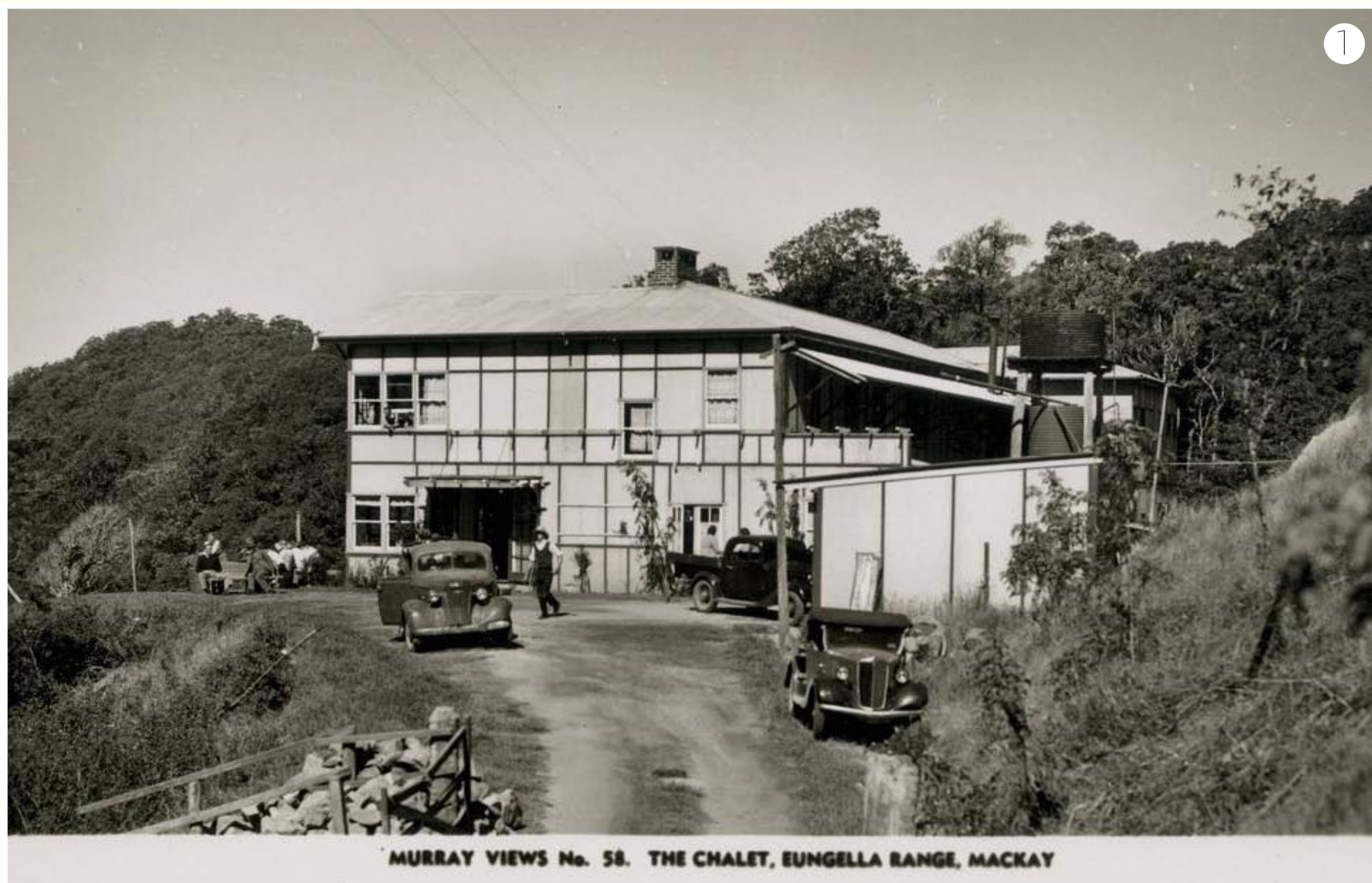
MURRAY VIEWS No. 58. THE CHALET, EUNGELLA RANGE, MACKAY